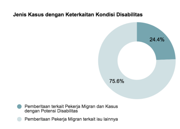
Figure 2. Types of Cases with Relation to Disability Conditions

In the mapping of segregation in the employment sector, the documentation also indicates four work sectors with vulnerable situations, which expose Indonesian migrant workers to conditions with disabilities. The four sectors of work are as follows: 1) Domestic Workers (34%), 2) Factory/Manufacturing (15%), 3) Fishing Ship Crew (12%), and 4) Construction (12%).